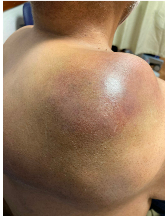
Figure 2. Bulky tumor on the patient's back

Lab work revealed acutely worsened anemia and the patient was subsequently transferred to the hospital for blood transfusion and closer monitoring. Vitals on arrival, including oxygen saturation levels, were within normal limits, and his physical exam was notable for diffuse bulky tumors. Notable lab results included a hemoglobin of 5.9 g/dl (reference range: 13.5 - 16.0 g/dl) down from 12.4 g/dl five days prior, lactate dehydrogenase 2,511 IU/L (reference range: 100 - 220 IU/L), haptoglobin 13 mg/dl (reference range: 14 - 258 mg/dl), and reticulocyte count 367 cells \times 10^9/L (reference range: 25 - 100 \times 10^9/L .) Blood smear was notable for schistocytes; Heinz bodies or bite cells were not seen. The patient's acute anemia coupled with hemolytic markers such as elevated lac-