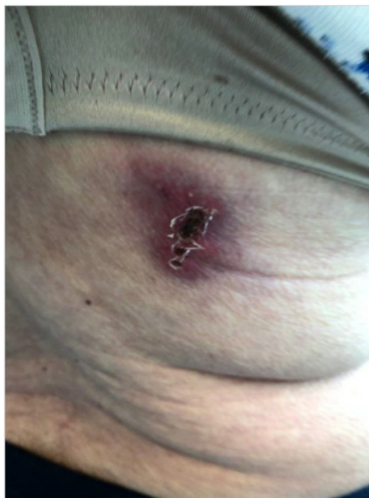
Figure 1. Erythematous lesion with a raised central black eschar

An 89-year-old female initially presented to outpatient clinic for systemic symptoms of high-grade fever, malaise and unintentional weight loss along with a rash that was presumed to be non-purulent cellulitis. After several courses of antibiotics, the patient's symptoms worsened and was eventually hospitalized. Blood cultures resulted positive for Francisella tularensis . After more history taking the patient noted that she was bit by a tick during a camping trip that resulted with the initial rash.