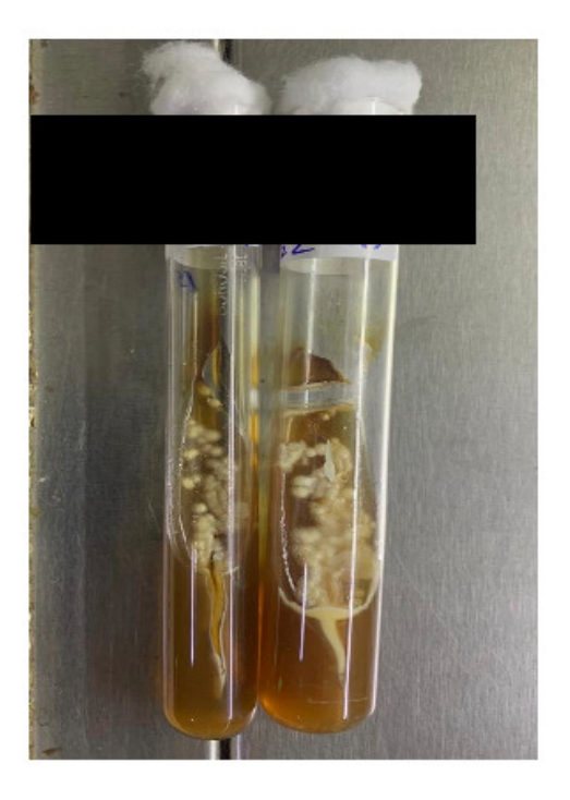
Figure 4. Growth of Candida parapsilosis in sabouraud dextrose agar, Colonies are cream colored, smooth and yeast like in appearance. It has grown rapidly within 24 hours both at 37"C and at room temperature