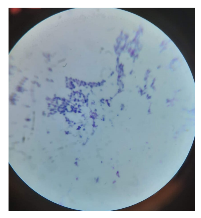
Figure 3. Tissue obtained from urine showing Papillary necrosis with Candida

A 55-year-old-man with diabetic kidney disease, chronic kidney disease (CKD stage 4), retinopathy, and coronary artery disease with a baseline serum creatinine level of 4.4 mg/dl, estimated glomerular filtration rate (GFR) 16ml/min, was admitted with severe COVID-19 pneumonia. He had hypoxia, for which he was administered intravenous (IV) methylprednisolone 40mg twice daily. As the serum creatinine increased to 8 mg/dl with oliguria, he