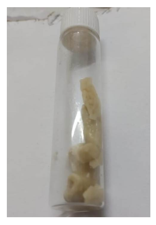
Figure 2. Flaky tissue in urine specimen

abdomen and pelvis showed right hydroureteronephrosis with no evidence of nephrolithiasis. The patient passed milky urine with large amounts of flaky tissue (Figure 2), which was confirmed to be necrotic renal papilla by histopathology (Figure 3). Potassium hydroxide (KOH) stain showed the presence of fungal elements in the necrotic renal papillary tissue, and culture grew Candida tropicalis. Previous urine cultures had grown multiple organisms, including E. coli and Klebsiella, at various times during the previous eight months. The patient underwent DJ ureteral stenting and was treated with fluconazole according to susceptibility testing. His renal function improved, and papillary tissue stopped appearing in the urine. Subsequently, urine culture also grew Mycobacterium tuberculosis. At present, the patient is on anti-tuberculous therapy (ATT) and fluconazole with a serum creatinine of 1.8mg/dl. Urine culture showed persistence of fluconazole-susceptible Candida tropicalis for eight months, and fluconazole 400mg daily was continued for eight months, after which creatinine stabilized and urine culture became sterile.