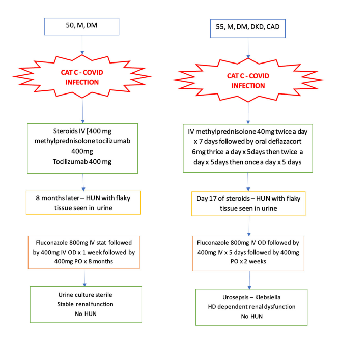
Figure 1. Timeline of development of infection in both patients DM – Diabetes Mellitus HTN – Hypertension CAD – Coronary Artery disease HUN – Hydroureteronephrosis HD - Hemodialysis

A 50-year-old man with a history of long-standing diabetes mellitus presented to the hospital with abdominal pain and dyspnea. Eight months prior to his current admission, he had been treated for severe COVID-19 pneumonia and pulmonary embolism with corticosteroids, tocilizumab, and systemic anticoagulants. The cumulative doses used during the treatment of COVID-19 were